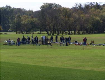
A Lot of People Showed Up!