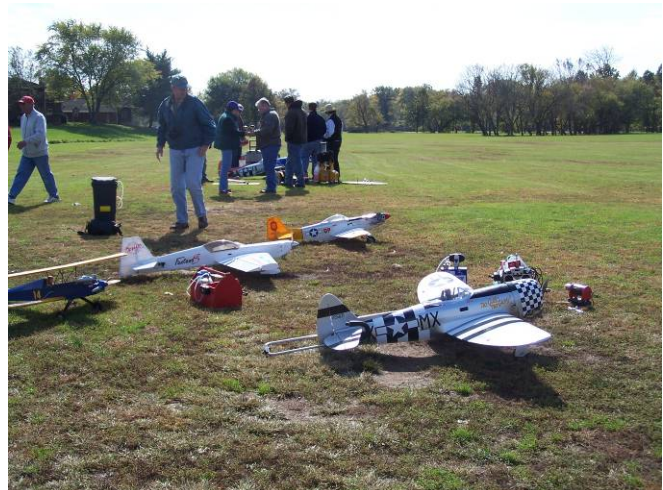
Some very impressive Warbirds!