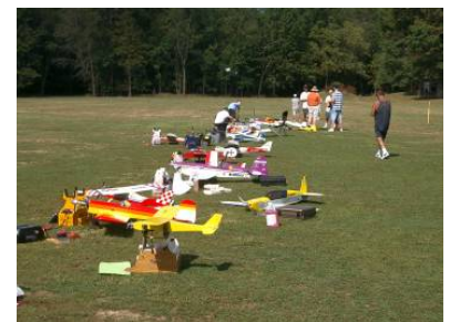
The flight line was very crowded – a very busy day.