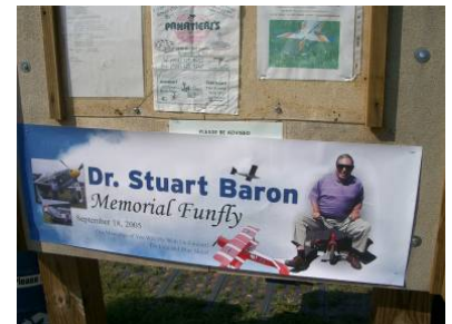
A banner commemorating the day.