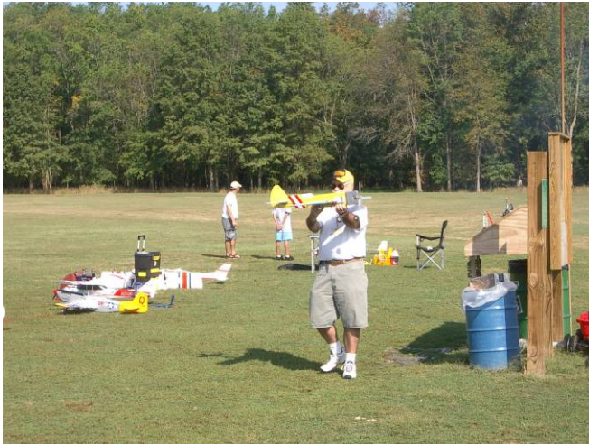
“LEN, YOU HAVE TO LET GO OF THE PLANE IF YOU WANT TO FLY IT.”

HOW MANY PILOTS DOES IT TAKE TO FLY RAY'S PLANE?